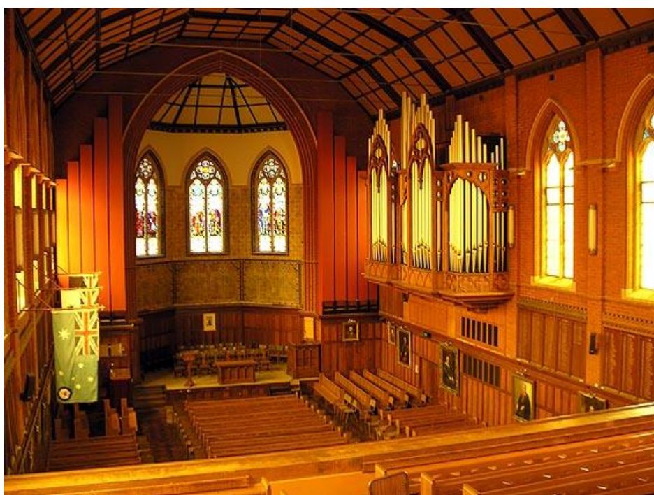
Memorial Hall at Scotch College, Melbourne