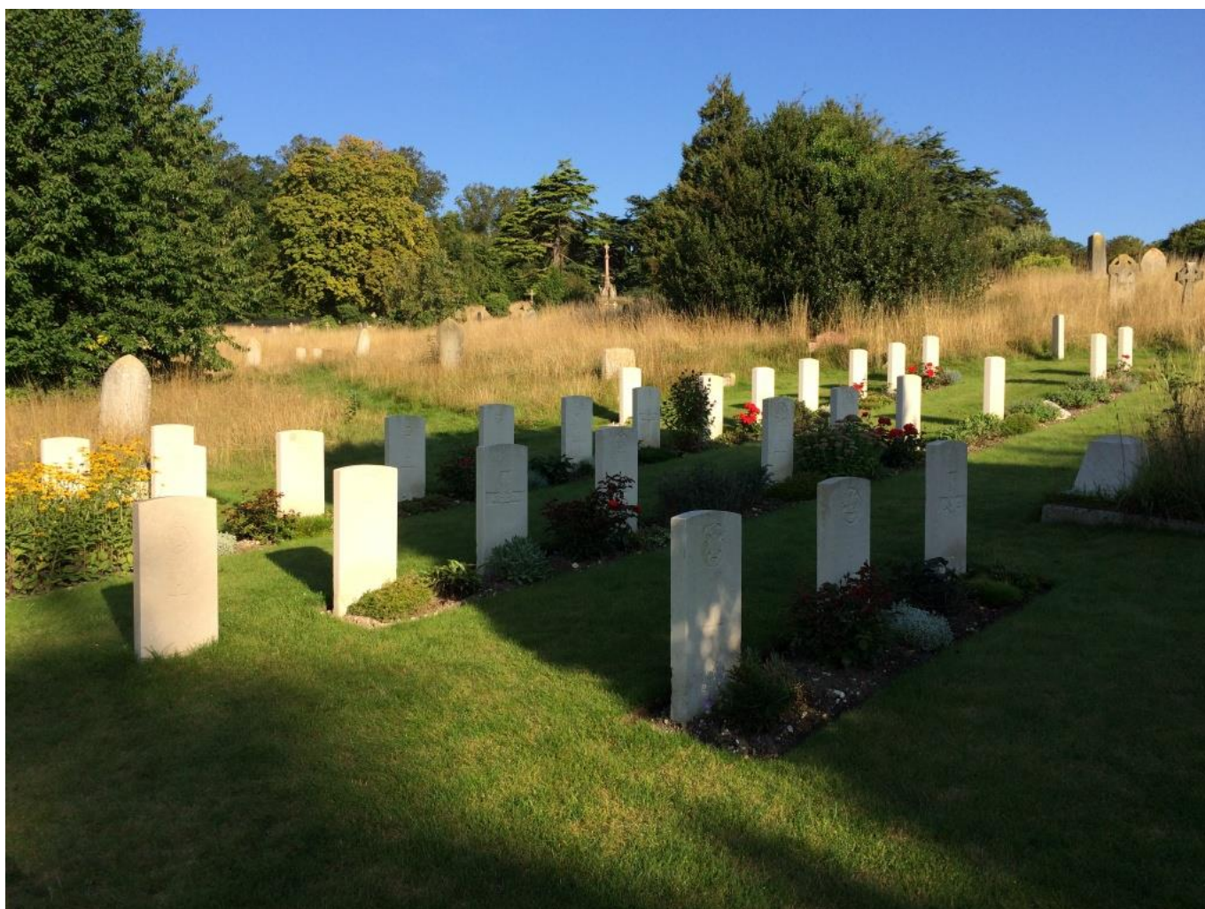
West Hill (Old) Cemetery, Winchester

West Hill (Old) Cemetery, Winchester contains 120 Commonwealth War Graves – 116 from World War 1 & 4 from World War 2.