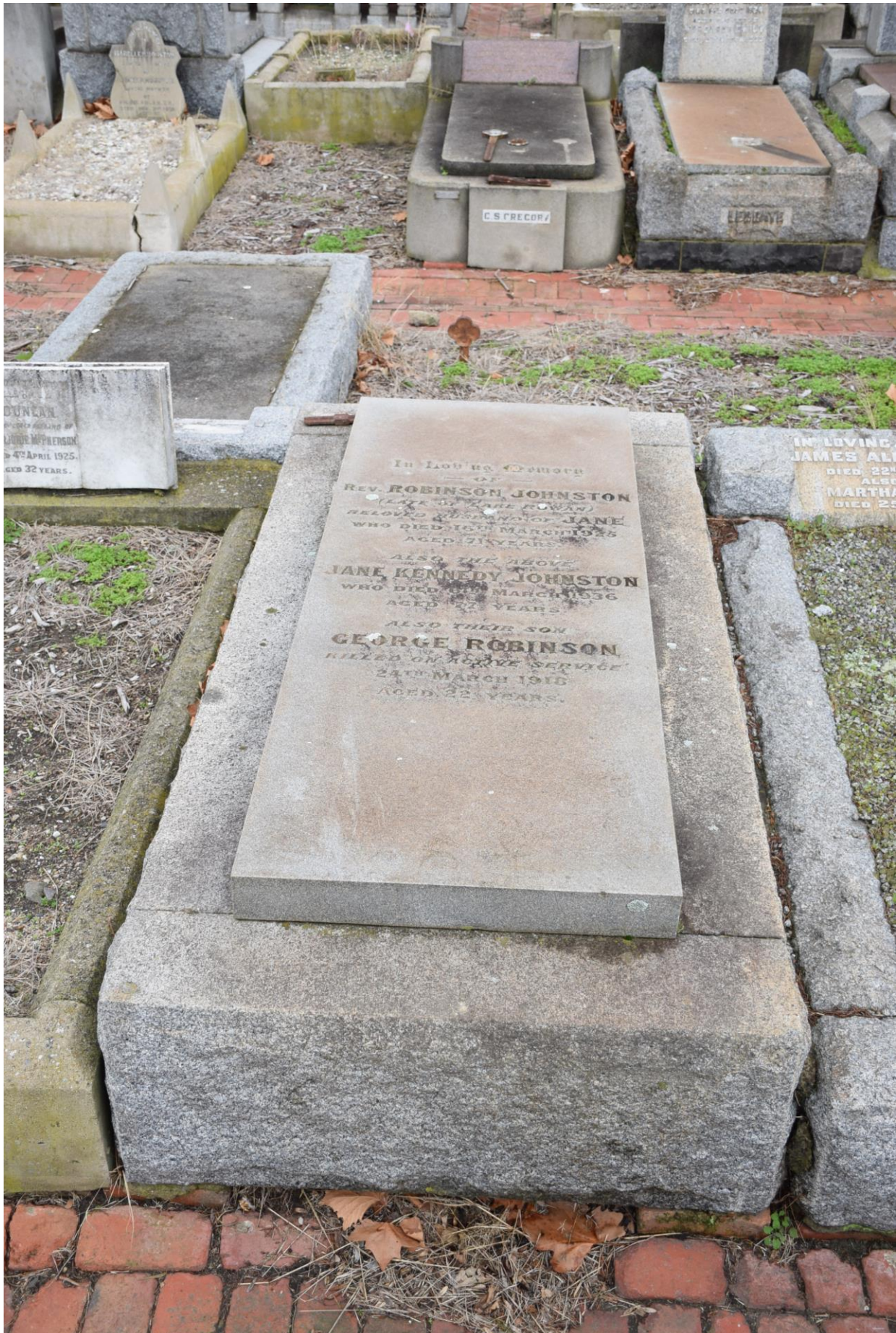
Johnston Family Headstone