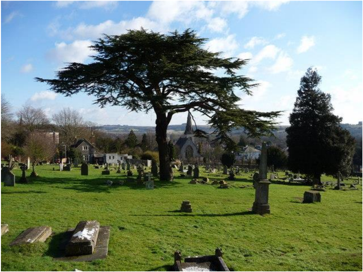
West Hill (Old) Cemetery, Winchester